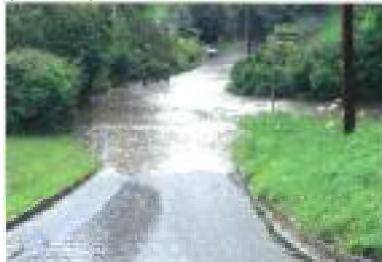
Sevenhampton Floods 2007

be taken into account in the costing of any preventative scheme. Gloucestershire Highways are considering the situation.