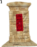
Detail from Quilt

invite you to join them on Wednesday 14th December at 8.15pm for mulled wine and mince pies