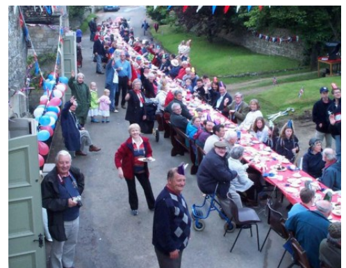
The rain came later . . .

The street party celebrating the Queen's Golden Jubilee in 2002.