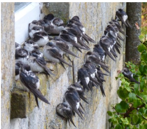
2012 these house martins paused on their way to Africa.